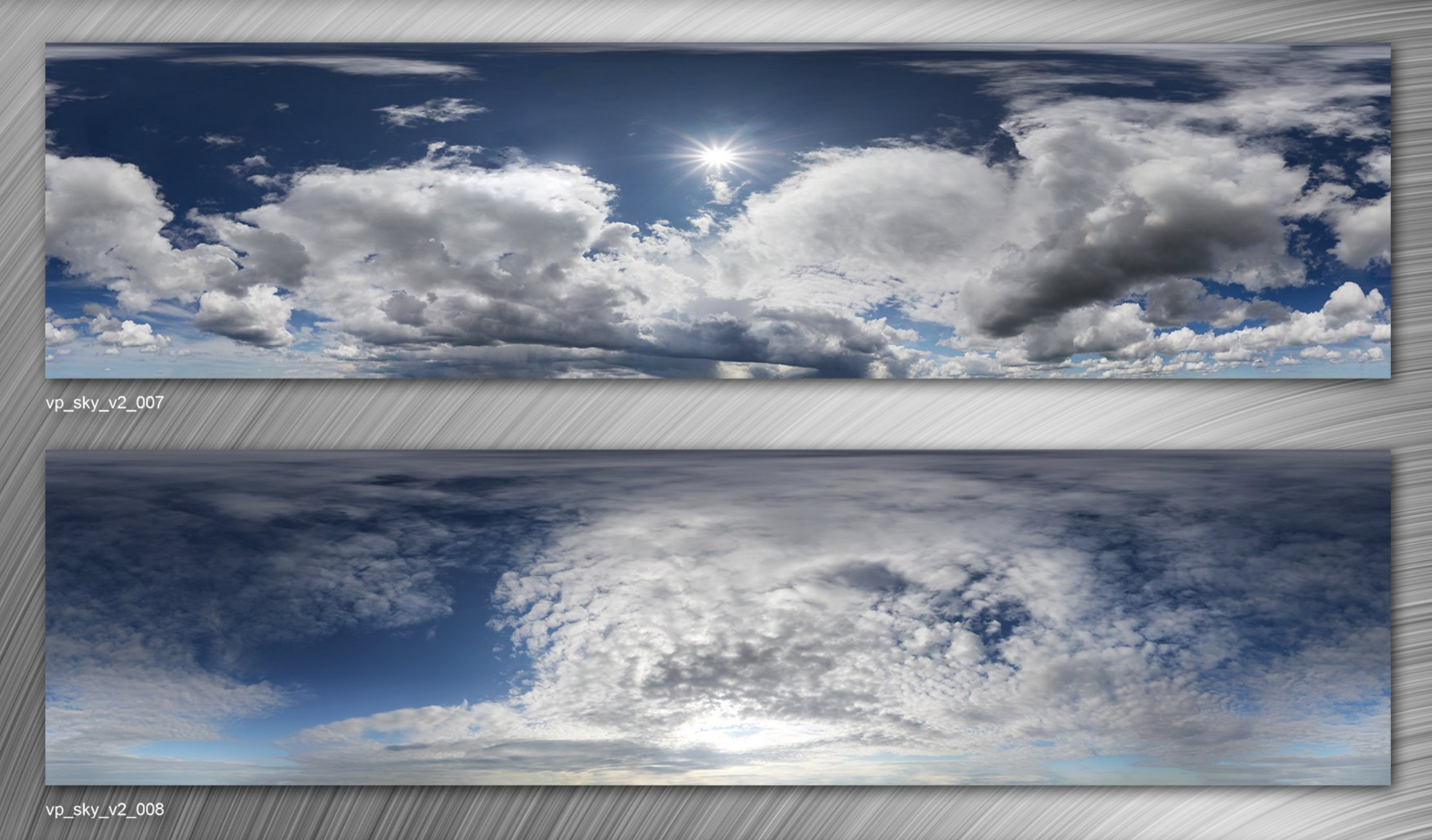
All images comes in 20 000 x 10 000 px resolution. All images can be purchased / downloaded from www.viz-people.com are on Royalty-Free non-exclusive license. License is personal and NON transferable. All images can be used for commercial purposes only by owners who bought this collection. The sharing of collection data is strictly prohibited unless that user has written authorization from "Viz-People Andrzej Gasior". For more information on our products, please visit us at: www.viz-people.com