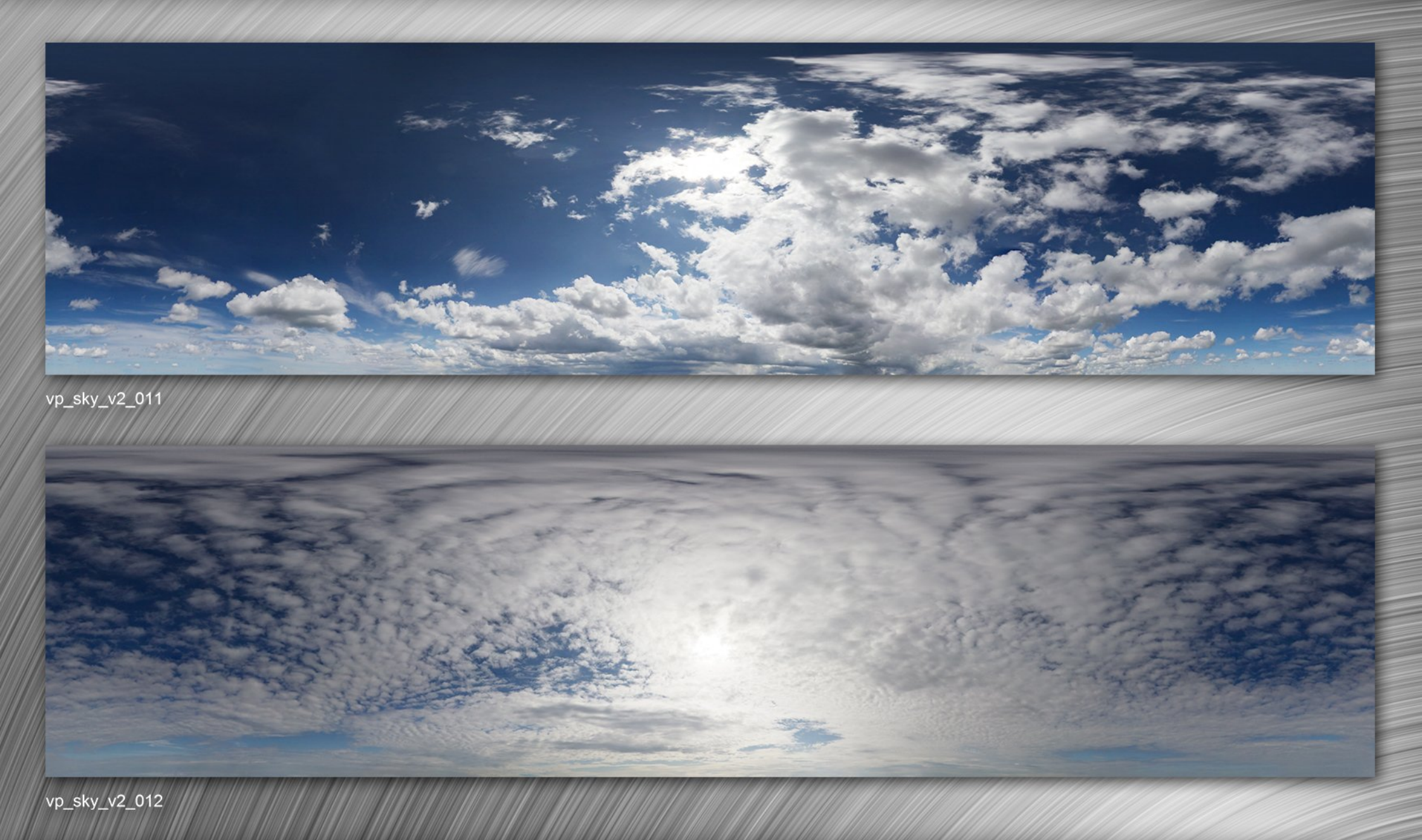
All images comes in 20 000 x 10 000 px resolution. All images can be purchased / downloaded from www.viz-people.com are on Royalty-Free non-exclusive license. License is personal and NON transferable. All images can be used for commercial purposes only by owners who bought this collection. The sharing of collection data is strictly prohibited unless that user has written authorization from "Viz-People Andrzej Gasior". For more information on our products, please visit us at: www.viz-people.com