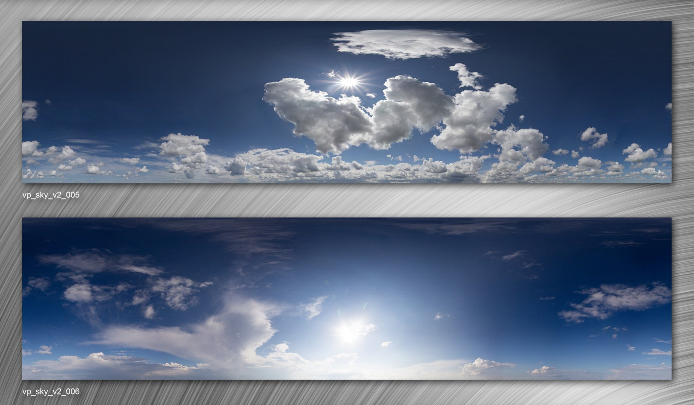
All images comes in 20 000 x 10 000 px resolution. All images can be purchased / downloaded from www.viz-people.com are on Royalty-Free non-exclusive license. License is personal and NON transferable. All images can be used for commercial purposes only by owners who bought this collection. The sharing of collection data is strictly prohibited unless that user has written authorization from "Viz-People Andrzej Gasior". For more information on our products, please visit us at: www.viz-people.com